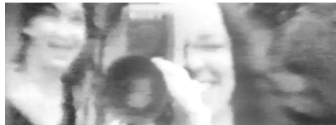
ANOTHER LOOK (AT THE MIAMI CONVENTION), WOMEN'S VIDEO NEWS SERVICE, 1972

After being released from prison, Pancho must decide whether to face the indignities of living an honest life as an ex-felon, or risk his freedom with a life of crime. Written by Oscar winners DJ Paul & Juicy J and featuring members of the Hypnotize Camp Posse living out mafia movie tropes via a realistic portrayal of life as an ex-con in the United States.