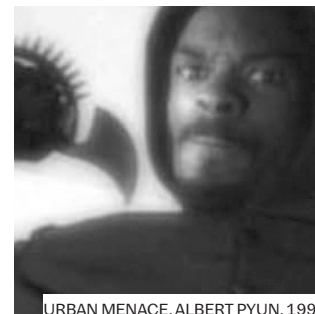
URBAN MENACE, ALBERT PYUN, 1999

Dir. Albert Pyun, 1999. United States. 72 min 8/2 10pm • 8/16 Midnight 8/26 10pm When dead mob bosses start piling up in the Bronx, all signs point to a mysterious hooded figure that's been lurking the streets since the Friendship Church burned down a year prior. A low-budget genre blend starring a host of 90s rap icons.