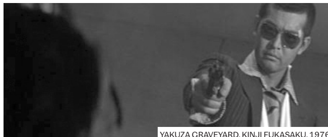
YAKUZA GRAVEYARD, KINJI FUKASAKU, 1976

Dir. Brewce Longo, 2024. United States. 97 min 8/13 7:30pm, $10 w/Q&A 8/25 5pm • 8/28 10pm Vi and Gumby's relationship is on the rocks. After a late-night encounter with the sorceress Clover, hearts are crossed and heads start to roll as a sinister mystery is revealed.